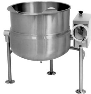
Model FT-40L Shown