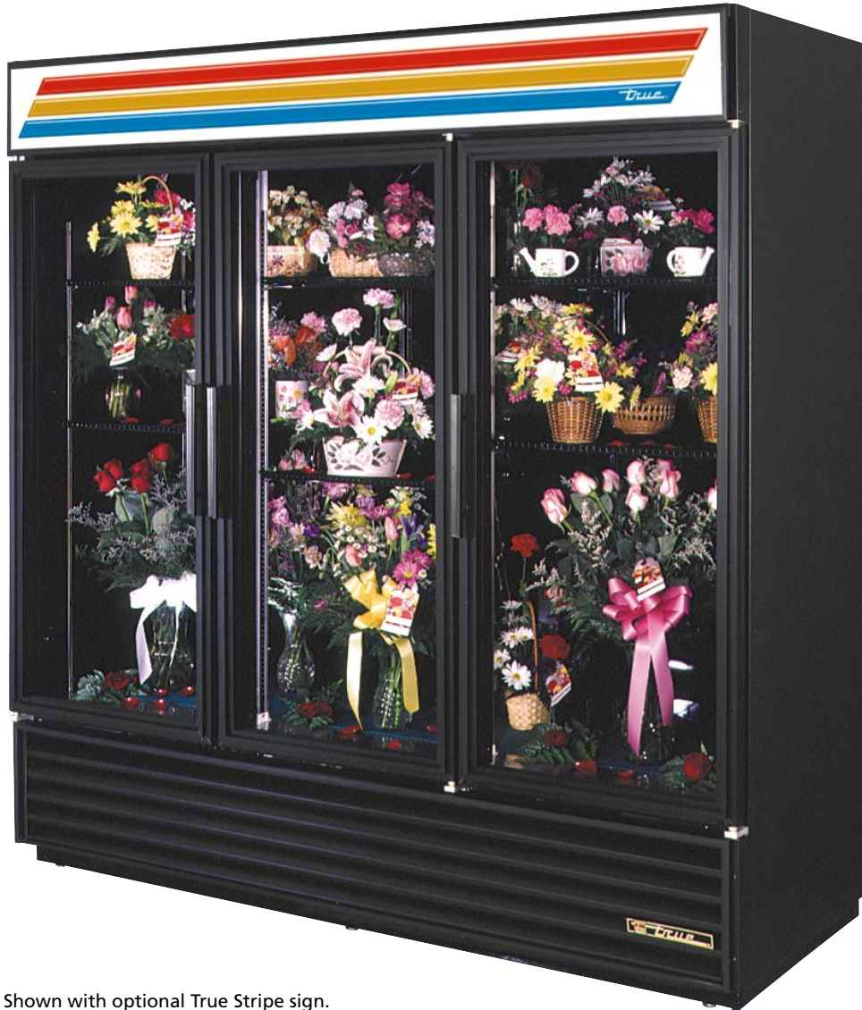
Shown with optional True Stripe sign.