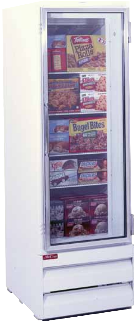
Shown is a bottom mount freezer