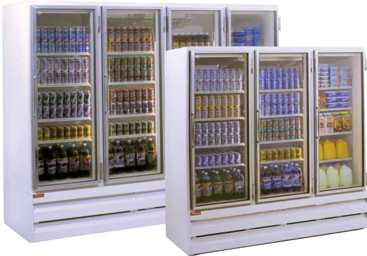
Shown with hinged glass doors