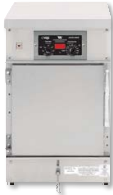
HA4503 CVAP® HOLDING CABINET HALF SIZE UNDER COUNTER MODEL WITH FAN Electronic Differential Control

CVap equipment complies with domestic and international requirements such as UL, C-UL, UL Sanitation, CE, MEA, and others.