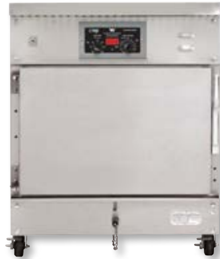
HA4507 CVAP® HOLDING CABINET HALF SIZE UNDER COUNTER MODEL WITH FAN Electronic Differential Control

CVap equipment complies with domestic and international requirements such as UL, C-UL, UL Sanitation, CE, MEA, and others.