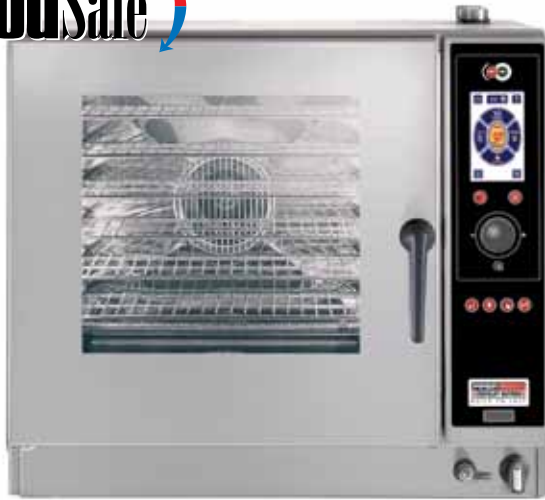
HME 061 X (Shown with X controls)