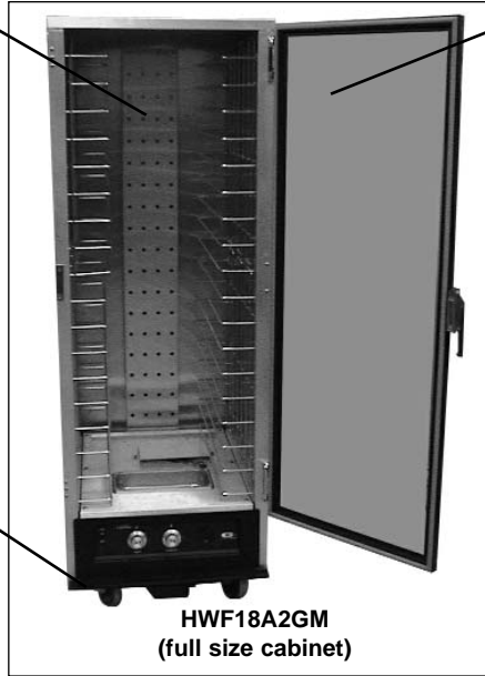
HWF18A2GM (full size cabinet)

DRIP TROUGH... Located at base of cabinet to catch condensation. Drain hole in center. Plastic drip pan below trough (provided) to catch condensation.