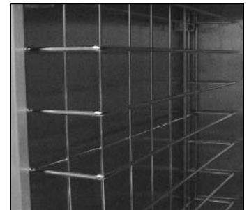
HWF fixed universal wire slides