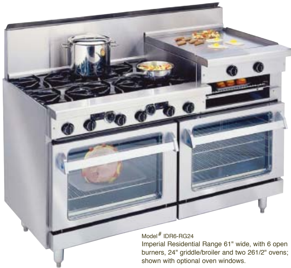
Model# IDR6-RG24 Imperial Residential Range 61" wide, with 6 open burners, 24" griddle/broiler and two 26 1/2" ovens; shown with optional oven windows.