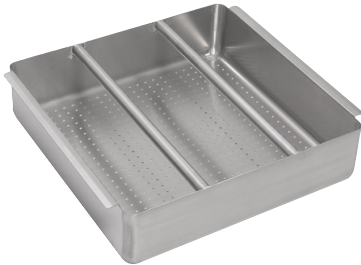
DISHTABLE PRE-RINSE BASKET