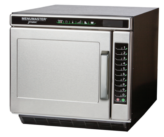
Model JET14 shown