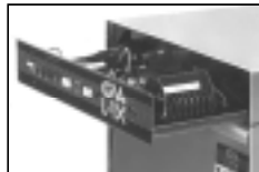
Convenient to service "Works-in-a-drawer", may be removed by unplugging one electrical connection.