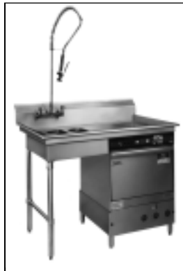
Optional dishtable, faucet and pre-rinse unit sold separately.