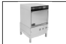
Optional pedestal allows the L-1X to be raised up to a full 12" off the floor for easy operator use. Height adjustable from 8" to 12".