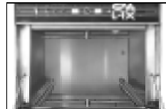
Upper and lower rotating wash arms guarantee excellent results.