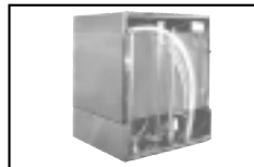
Pumped drain will drain uphill. Requires no floor drain.