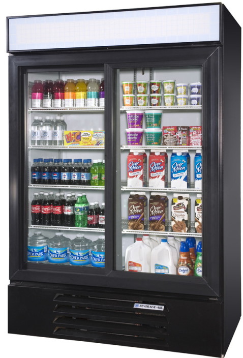
LV45-1-B (shown with 4 shelves per section)

MODEL: LV45-1-B LV45-1-W LV45-1-B-LED LV45-1-W-LED