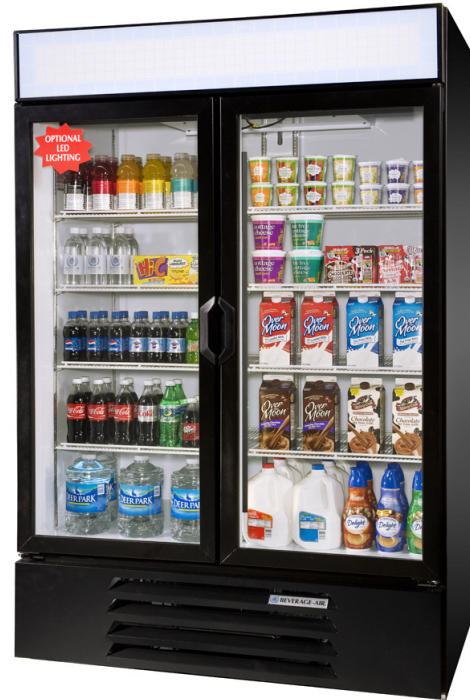
LV49-1-B (shown with 4 shelves per section)

MODEL: LV49-1-B LV49-1-W LV49-1-B-LED LV49-1-W-LED