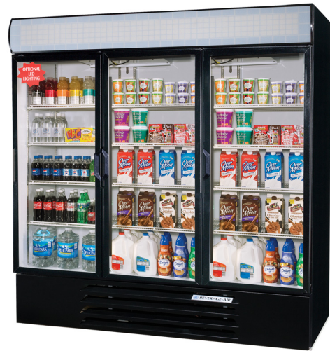
LV72Y-1-B (shown with 4 shelves per section)

MODEL: LV72Y-1-B LV72Y-1-W LV72Y-1-B-LED LV72Y-1-W-LED