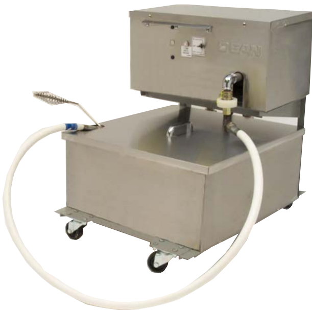
MF90AU/80 portable oil filter, 80 lbs. (45 L) max. oil capacity (shown with return hose)

Flexibility - Available in gravity drain (U) or suction type/reversible pump (AU) for filtering of countertop fryers.