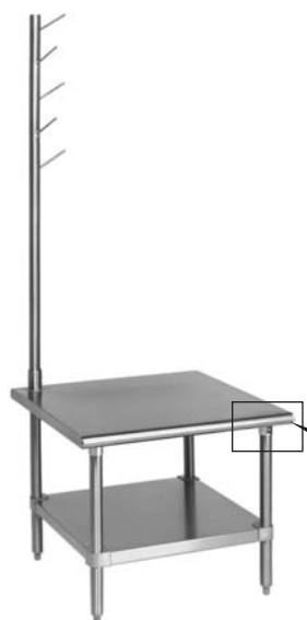
mixer stand shown with optional utensil rack

Eagle Utensil Rack, model UR-501, for mixer stands. 1½"-diameter stainless steel rod with five ⅝" stainless steel rods, approximately 5" long, for utensils. Note: unit is factory installed.