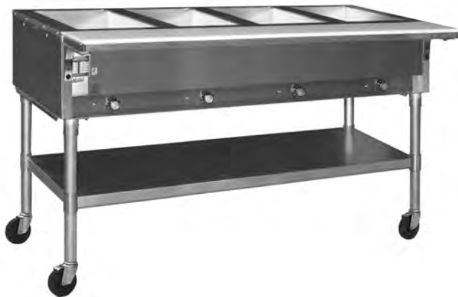
#PDHT4-120 portable hot food table

Eagle Hot Food Tables, open base design, model _____ . Top and body to be heavy gauge type 430 stainless steel. Beaded top openings to be 12 3/32" x 20 3/32". Heating compartments to be 8"-deep, galvanized, and insulated on all four sides and bottom with 1" fiberglass or equal. Recessed control panel with individual infinite controls offer high and low settings. Each compartment fitted with 500-watt heating element for 120-volt units, and 750-watt heating element for 240-volt units. Six foot cord and plug extends from the bottom right hand side of the unit. Furnished with polycarbonate cutting board. Legs to be 1 1/2" O.D. tubing, with adjustable undershelf and 4"-diameter casters.