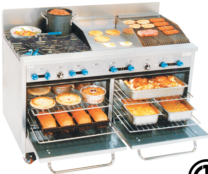
Model F3226-18-1.5RB (shown w/ optional casters & extra racks)