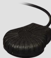
Foot Pedal (optional*)