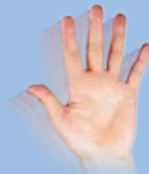
Lite Weigh Hands-Free