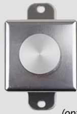
(optional*) Mountable Pushbutton