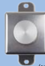
(optional*) Mountable Pushbutton