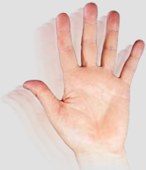
Lite Weigh Hands-Free