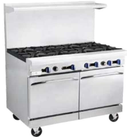
R-R8 Shown on Optional Casters