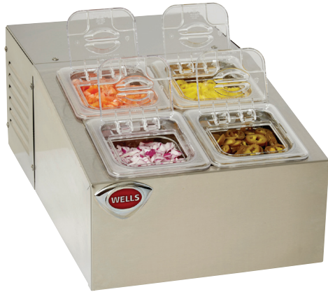
Model RCTS-4 (food not included)