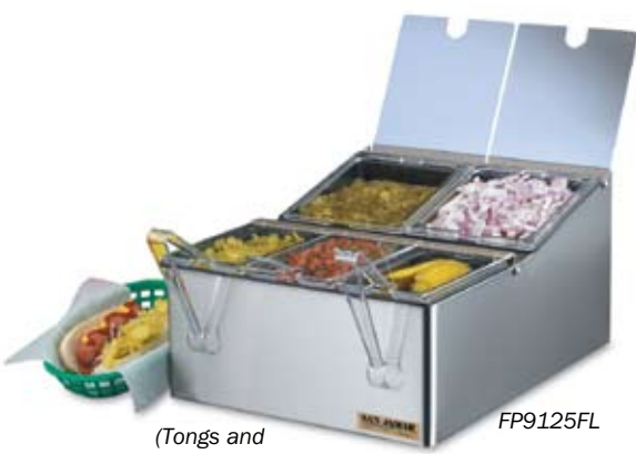
(Tongs and spoons included.)