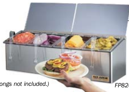
(Tongs not included.)