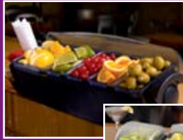
BD4005S & BD2001's Shown

The all-in-one garnish solution designed by bartenders for bartenders. Tailored to fit on standard mixing rails, The Dome® features a patented domed lid that rotates back for easy access and increased capacity when closed. Integrated snap-on caddies store straws, stirrers and picks. The Mini Dome® offers all the benefits listed, but in a small footprint. New connector provides modularity between Mini Dome® and Dome® (two connectors included with each Mini Dome®).