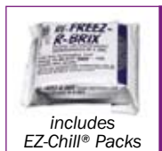
includes EZ-Chill® Packs

The Ultimate Garnish Center is perfect for martini garnishes and includes 15 interchangeable inserts allowing you to design the garnish center that best meets your needs. Ultimate Garnish Center features ice liners for use with EZ-Chill® Ice Packs or ice to keep garnishes chilled.