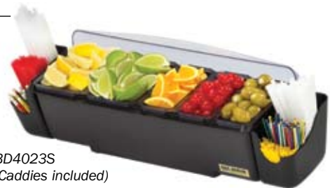
BD4023S (Caddies included)