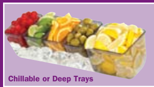
Chillable or Deep Trays