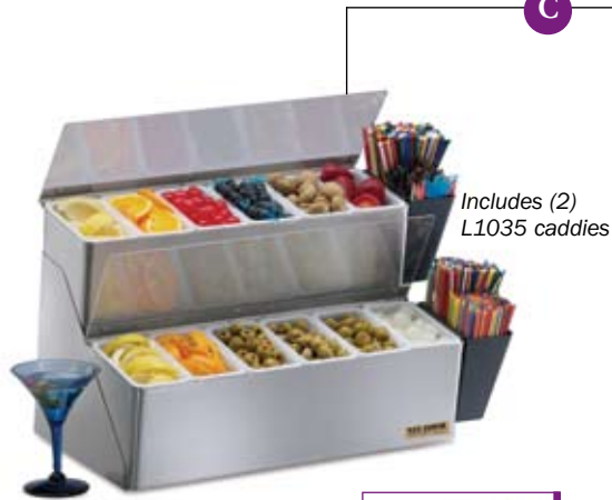
Includes (2) L1035 caddies