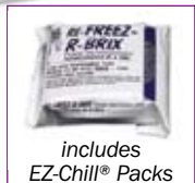
includes EZ-Chill® Packs

EZ-Chill® Garnish Centers feature ice liners for use with EZ-Chill® Ice Packs or ice to keep garnishes chilled. Full-size hinged lids will not rust and protect garnishes from spills and contaminants.