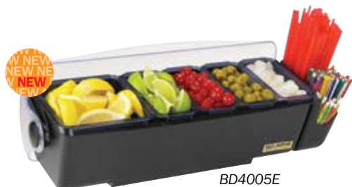
BD4005E The Dome® Essential