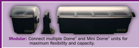
Modular: Connect multiple Dome® and Mini Dome® units for maximum flexibility and capacity.