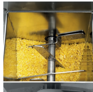
Mixing hopper designed to better knead pasta dough