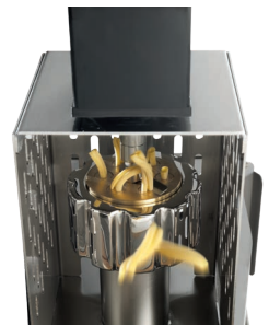
Pasta Cutter Accessory