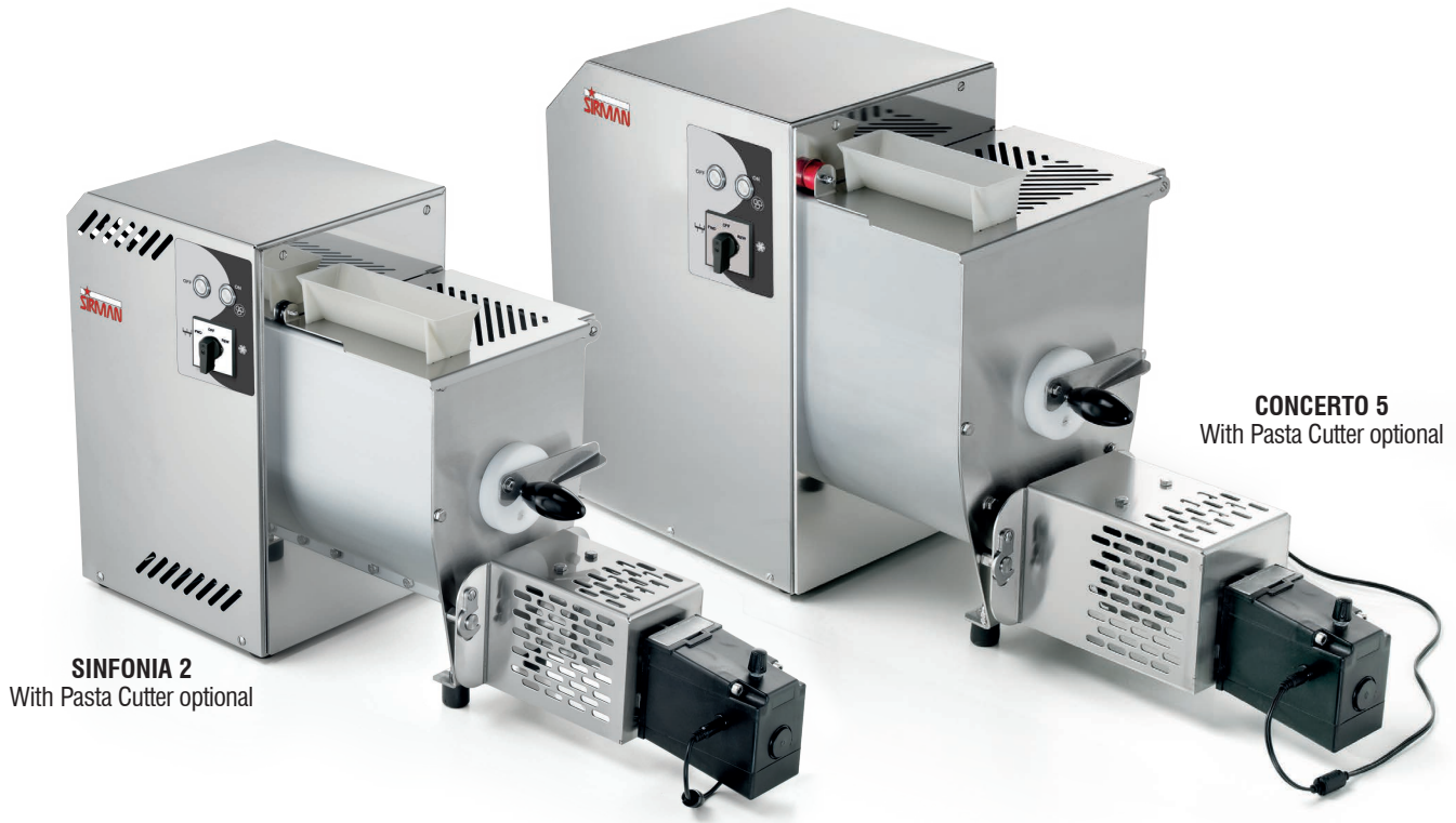
SINFONIA 2 With Pasta Cutter optional