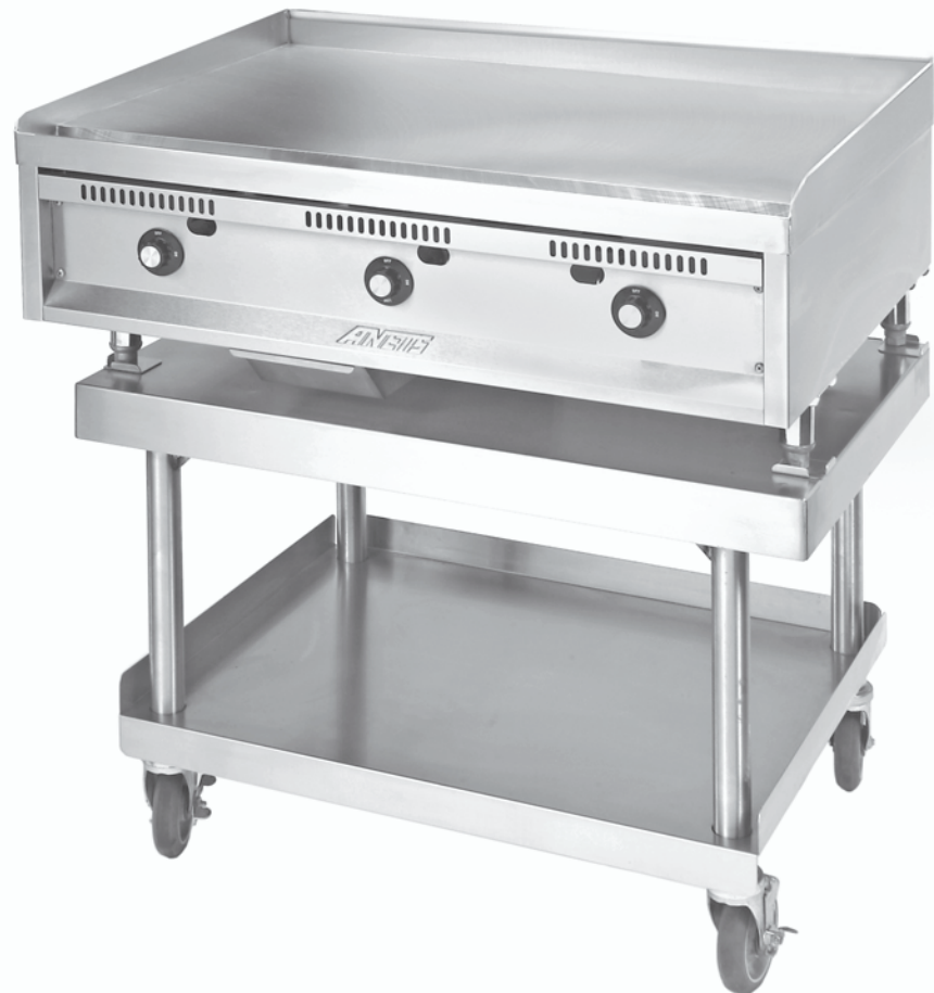
SLMG 24x36 shown optional stainless steel stand with undershelf and casters