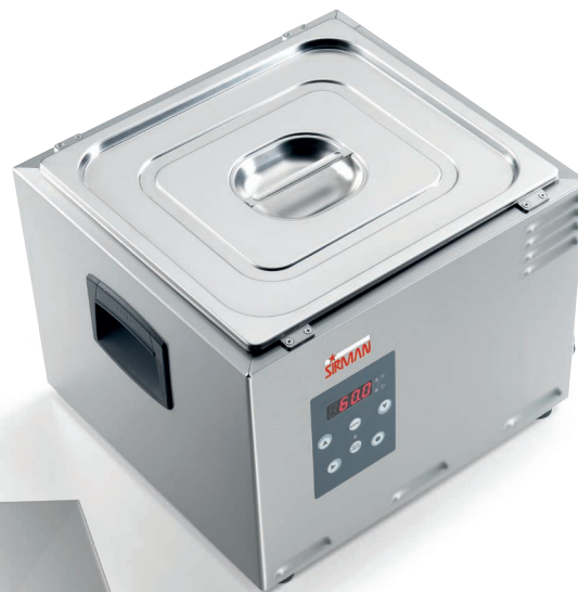
SOFTCOOKER S 2/3 GN