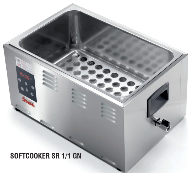
SOFTCOOKER SR 1/1 GN