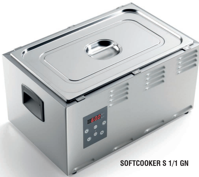
SOFTCOOKER S 1/1 GN