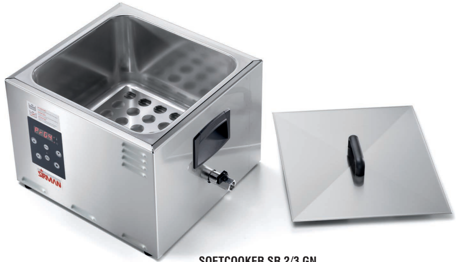
SOFTCOOKER SR 2/3 GN

Certified to UL Standard 197 and NSF Standard 04 Certified to CSA Standard C22.2