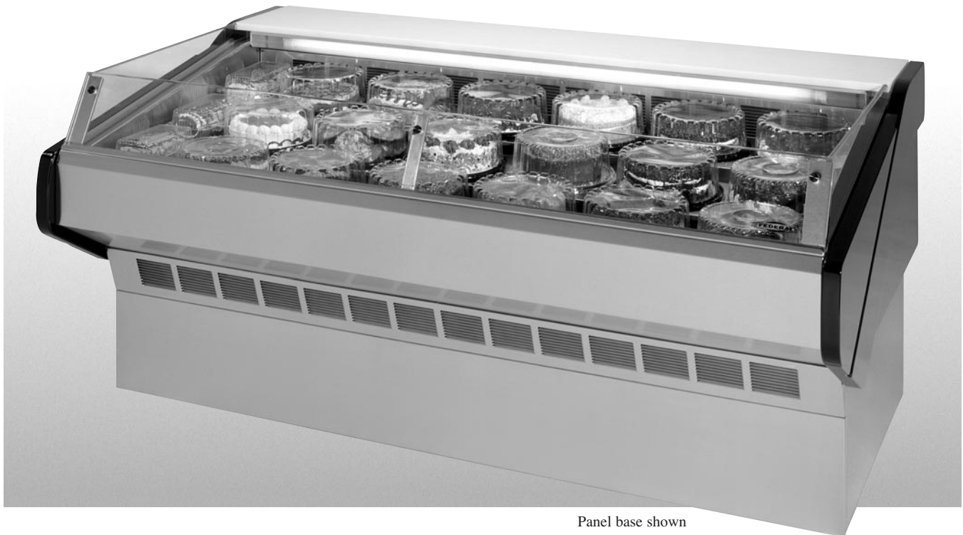
Panel base shown

MODEL SQ-3CBSS SQ-6CBSS SQ-4CBSS SQ-8CBSS SQ-5CBSS