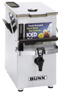
PTD4 with Brew-Through lid

Dimensions: 17.1"H x 9.1"W x 15.7"D (43.4cm H x 23.1cm W x 39.9cm D)