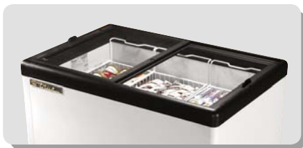
Shown with optional novelty wire baskets.