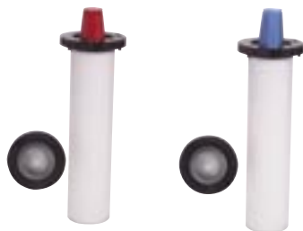
Individual DAC-5 and DAC-10 Units

The Dial-A-Cup™ dispensing system is a unique, new way to dispense almost all standard beverage cups. Dial-A-Cup's one size fits all concept allows the operator to change cup styles without worrying about how the new cups will fit in the cup dispenser.