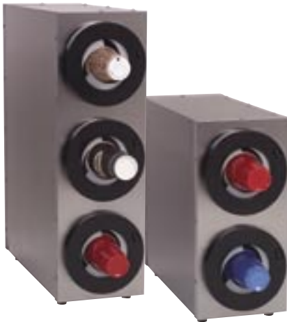
DAC-30 and DAC-20

Dial-A-Cup™ Cup Dispensers Models: DAC-30, DAC-20 LS-20, LS-30