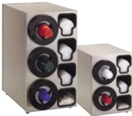
LS-30 and LS-20