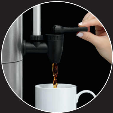
Easy-Pour Lever and Cool-Touch Dripless Pour Spout