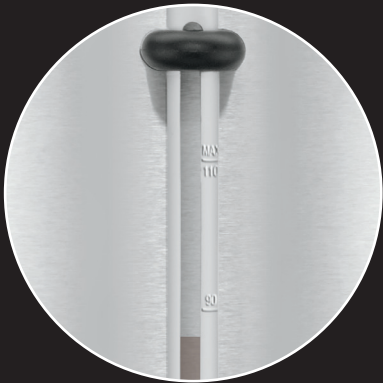
Sightglass for Viewing Brew Level